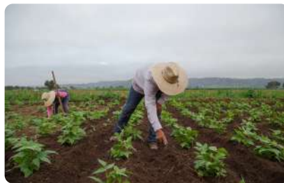
Agriculture & Plantation