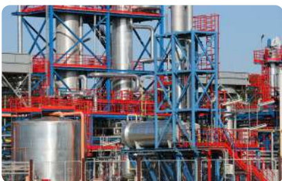
Oil & Gas Petrochemicals