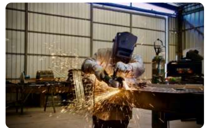
Engineering & Fabrication